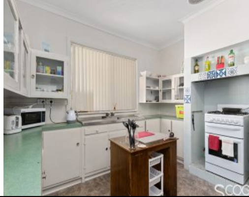
94 Watkins Street White Gum Valley, WA